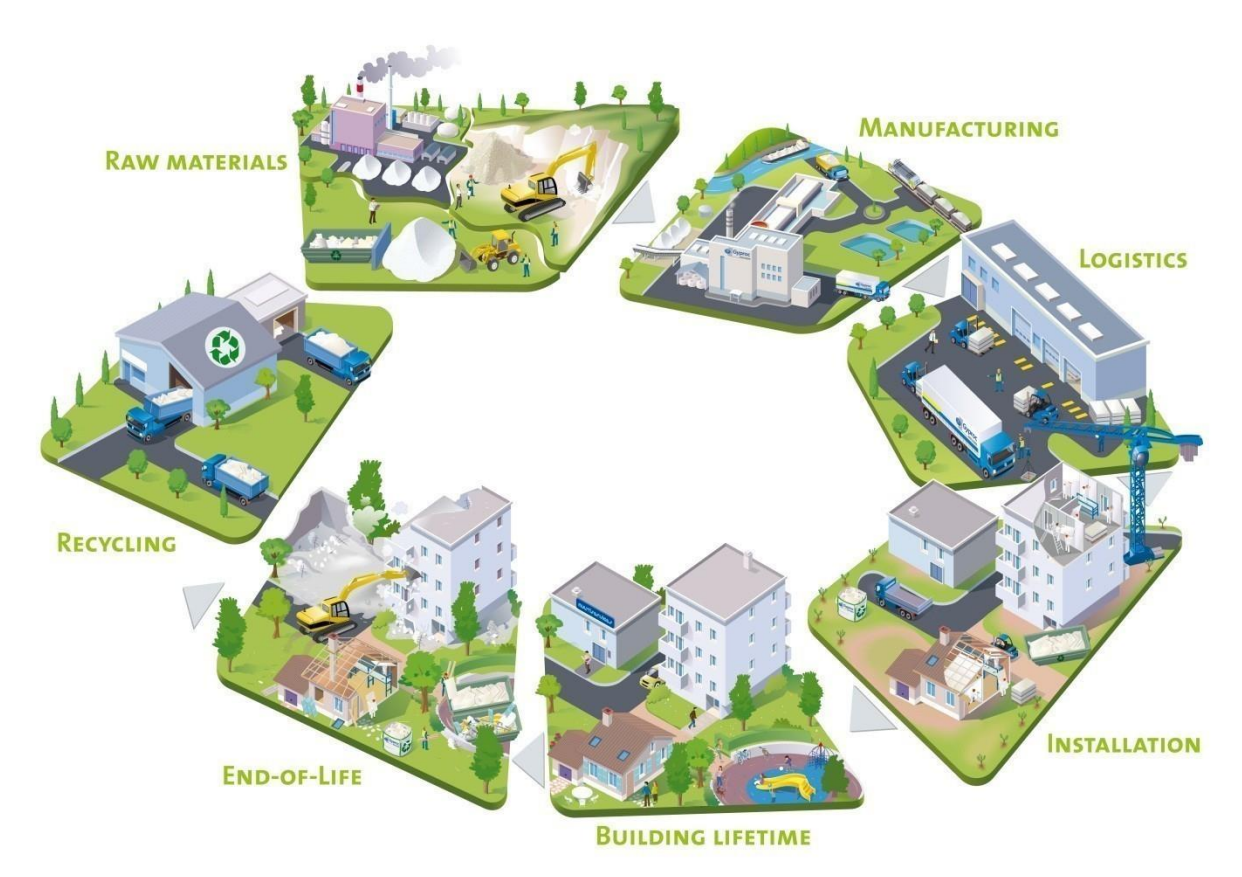
Figure 1: Flow diagram of the product life cycle. The process of the product life cycle is described below.