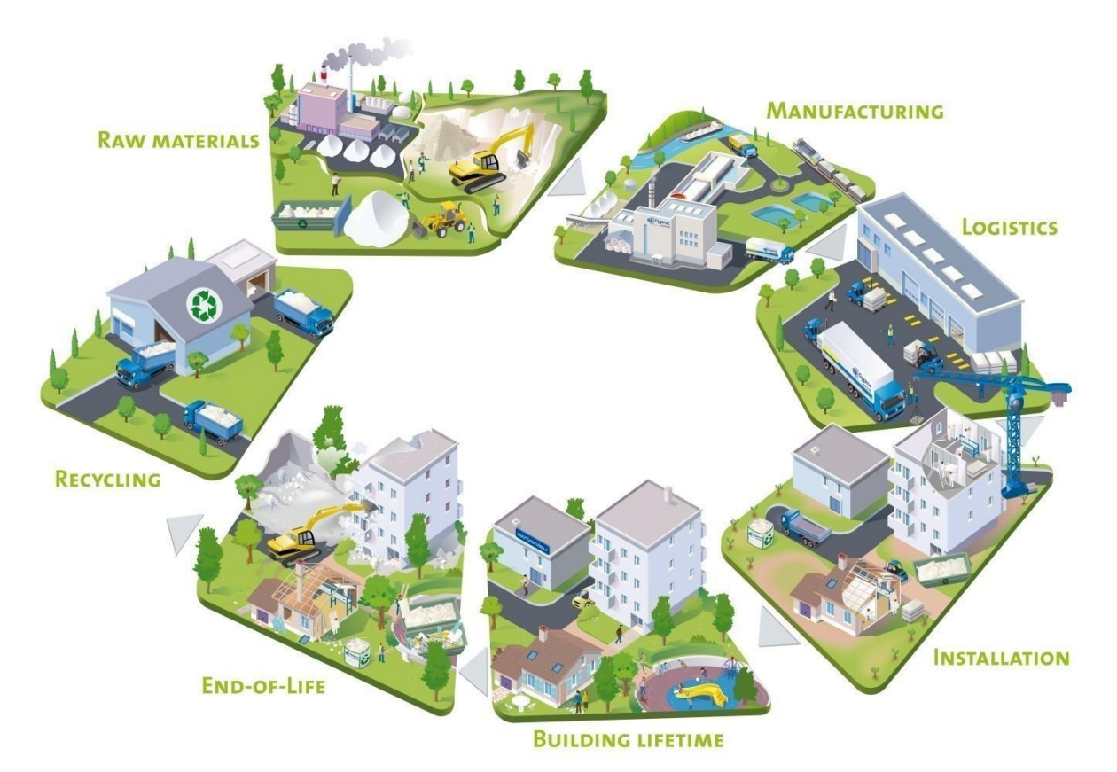
Figure 1: Flow diagram of the product life cycle. The process of the product life cycle is described below.