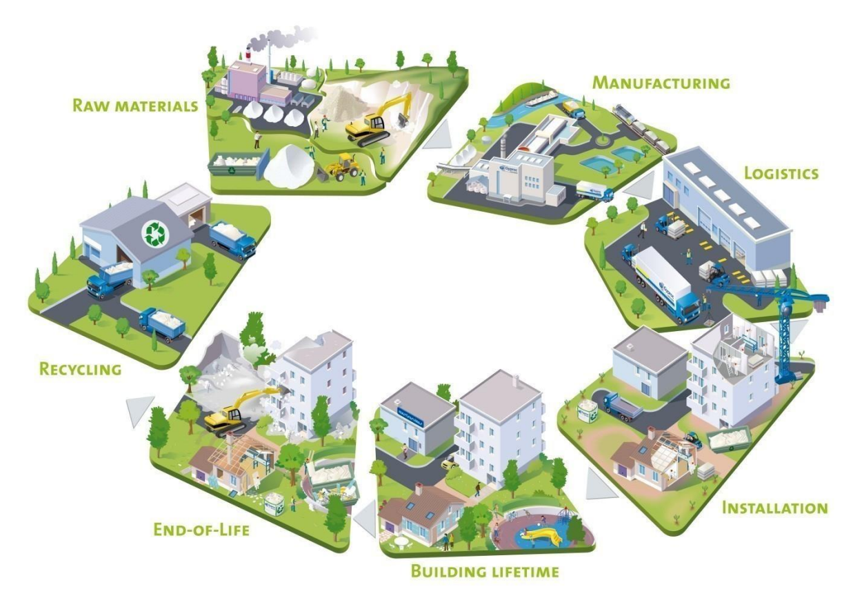
Figure 1: Flow diagram of the product life cycle. The process of the product life cycle is described below.